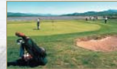
One of many outstanding local championship links courses.

Adjacent to championship golf courses, blue flag beaches as well as being part of the renowned Kerry Way, walking and cycling tours arranged on request.