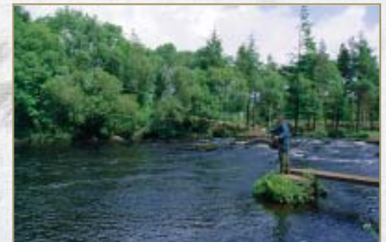
Peace at Journey's End

Adjacent to championship golf courses, blue flag beaches as well as being part of the renowned Kerry Way, walking and cycling tours arranged on request.