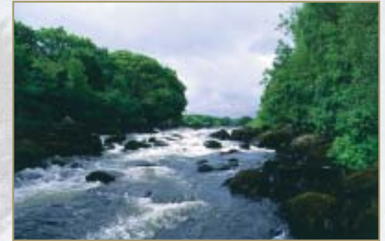
The Caragh River, the standard of purity by which the European Community measure water quality.