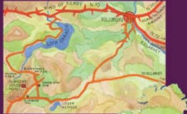
Above map part of the spectacular Kerry Way.